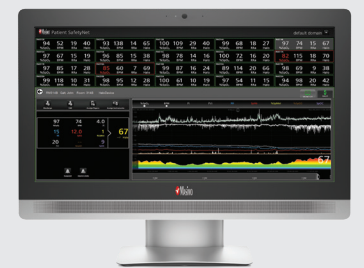
Patient SafetyNet View Station Supplemental Remote Monitoring and Clinician Alarm Notification